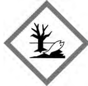
Danger Hazardous to aquatic life

Toxicity Data, Environmental Fate, Physical/Chemical Data, or other Data Supporting Environmental Hazard Statements: Water Hazard Class 2 (Self-assessment): Very toxic to fish. Do not allow product to reach ground water, water streams or sewage system. Also poisonous for fish and plankton in water bodies. R50/53 Very toxic to aquatic organisms may cause long-term adverse effects in the aquatic environment.