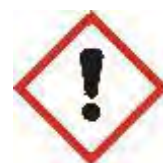
Warning Causes Skin Irritation

Keep away from heat/sparks/open flames / hot surfaces. No smoking.