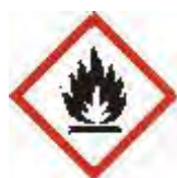
Warning Highly Flammable Liquid and Vapour