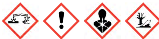
GHS05 GHS07 GHS08 GHS09