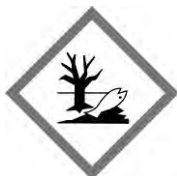
Danger Hazardous to aquatic life

Toxicity Data, Environmental Fate, Physical/Chemical Data, or other Data Supporting Environmental Hazard Statements: Water Hazard Class 2 (Self-assessment): Very toxic to fish. Do not allow product to reach ground water, water streams or sewage system. Also poisonous for fish and plankton in water bodies. R50/53 Very toxic to aquatic organisms may cause long-term adverse effects in the aquatic environment.