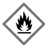
Warning Highly Flammable Liquid and Vapour