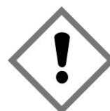
Warning Causes Skin Irritation

Keep away from heat/sparks/open flames / hot surfaces. No smoking.